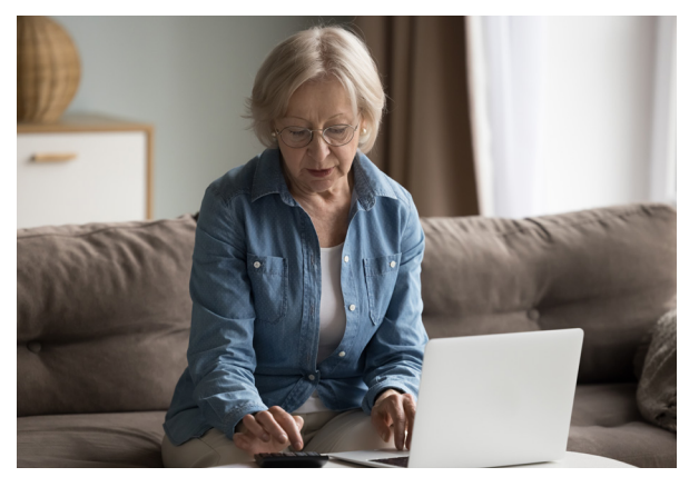
It's imperative senior citizens do their due diligence when selecting a health insurance plan. Your local health care providers can help.

At first glance, it may be easy to see the appealing parts of Medicare Advantage. Original Medicare includes Part A, for in-patient hospital