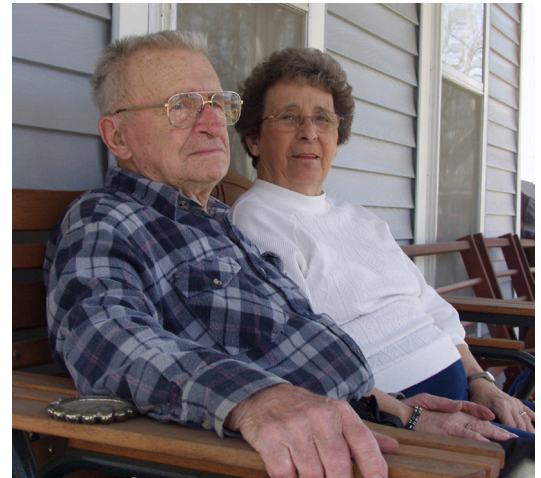
Rural citizens need to carefully review of Medicare Advantage plan as they may have trouble finding approved providers and rehabilitation services near their home.

Medicare Advantage plans may be especially problematic for people in rural areas. A 2021 study found that rural Medicare Advantage plan enrollees were nearly twice as likely to switch back to Original Medicare as those in urban areas. The network of providers in rural areas are especially narrow, making it harder for people to get care.