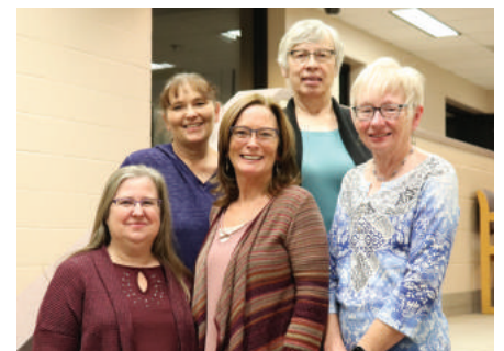
Pictured are some of the workshop leaders.

FEE: Free * MUST REGISTER PRIOR TO ATTENDING