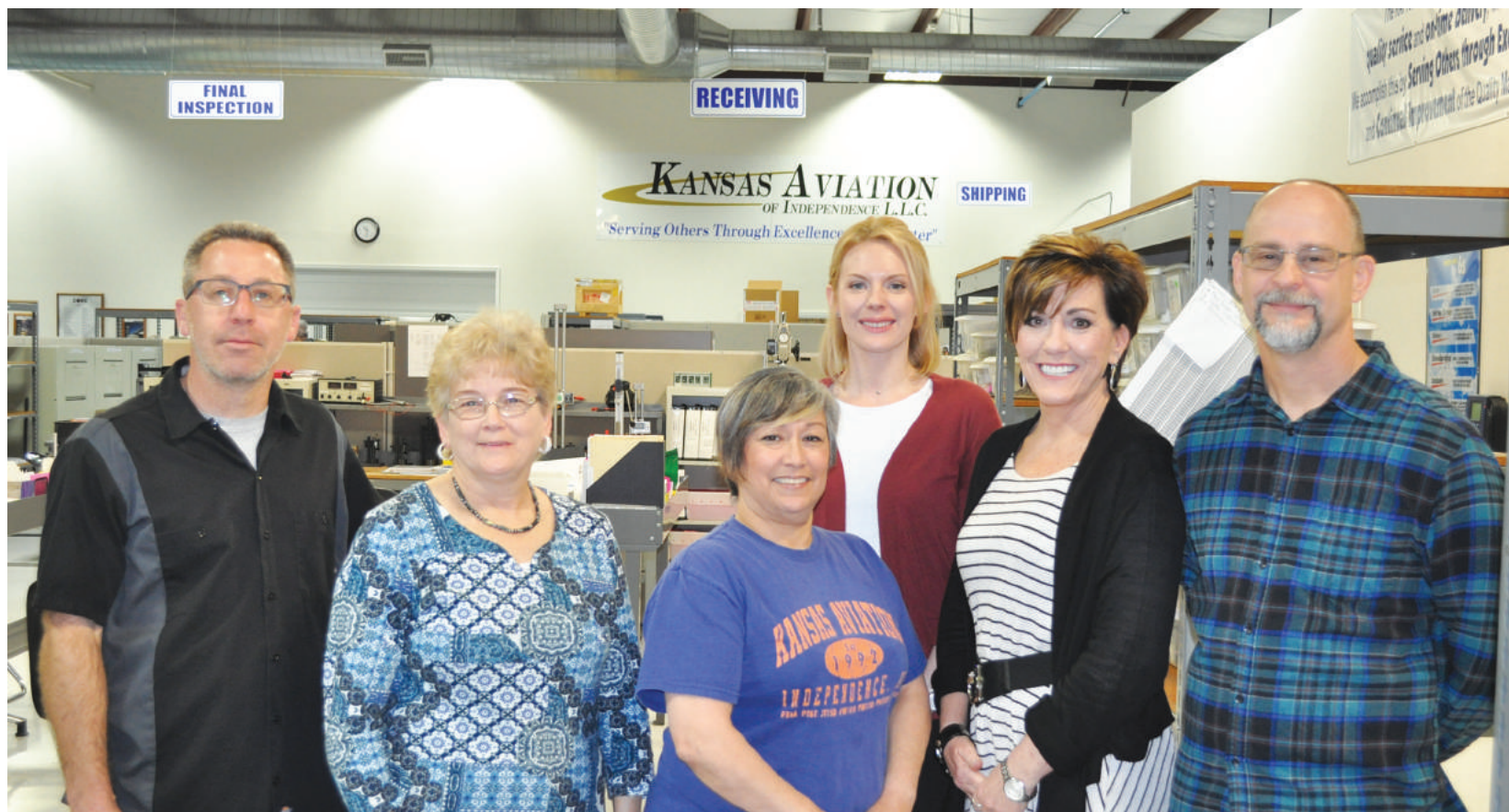
KANSAS AVIATION - CRMC BUSINESS & INDUSTRY HEALTH PARTNER