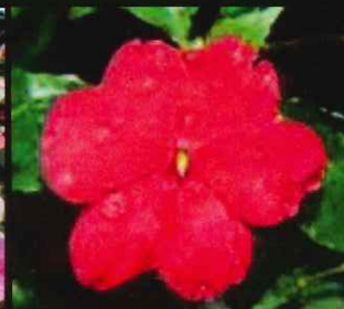
Vinca (Periwinkle) Red