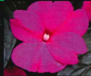
Impatiens New Guinea Paradise Fuchsia