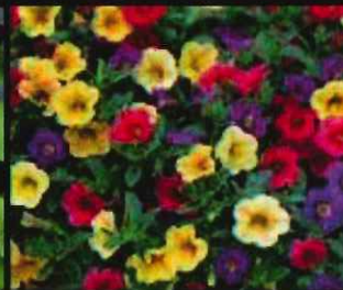
Calibrachoa (Callie) Mix