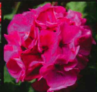
Zonal Geranium Rose Pink