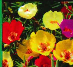
Portulaca (Rose Moss) Mix