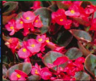
Begonia Bronze Leaf Pink or Red