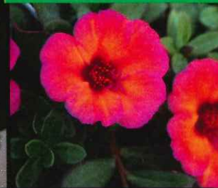
Purslane Tequila Sunrise