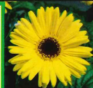
Gerbera Daisy Yellow