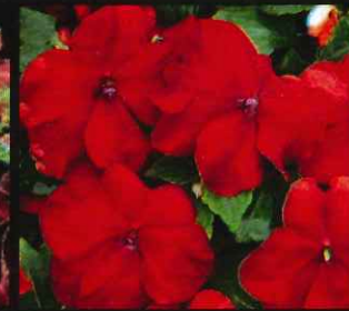
Impatiens Xtreme Red