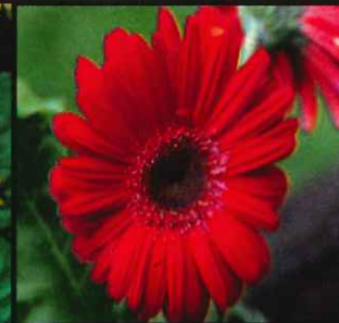
Gerbera Daisy Red