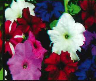
Petunia Bravo Mix