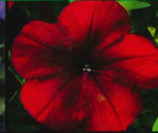
Petunia Bravo Red