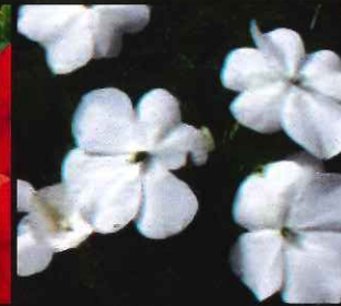
Impatiens Xtreme White