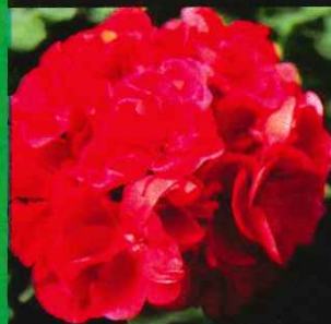
Zonal Geranium Bright Red