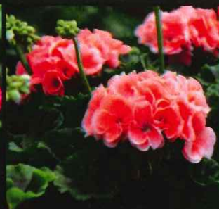
Zonal Geranium Salmon