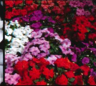
Impatiens Xtreme Mix