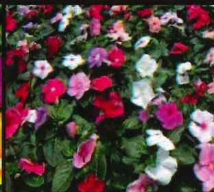
Vinca (Periwinkle) Mix