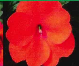
Impatiens New Guinea Electric Orange