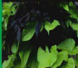
Sweet Potato Vine