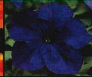
Petunia Bravo Blue